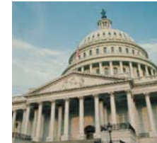
Treasury Inf-Prot Sec